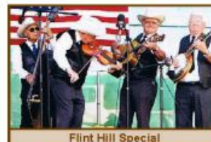
Flint Hill Special