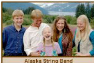
Alaska String Band