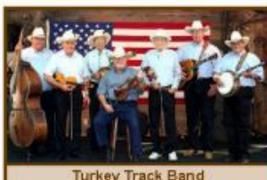
Turkey Track Band