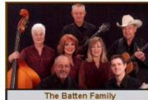
The Batten Family