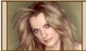
Rhonda Vincent & Rage

HOG ROAST & POTLUCK SUPPER Wed. 5:00 pm Bring a Covered Dish & Your Own Table Service