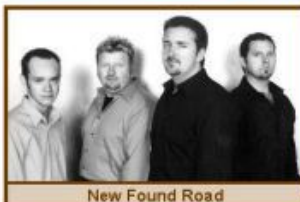
New Found Road