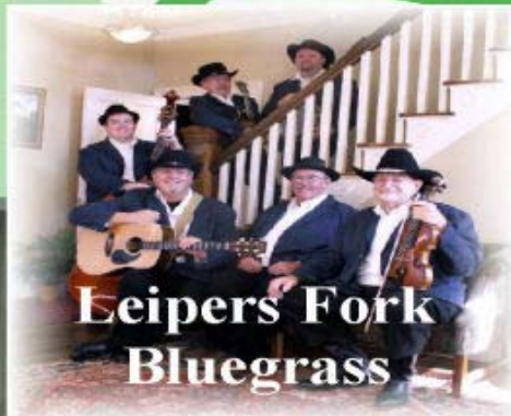
Leipers Fork Bluegrass